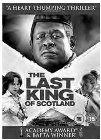
Poster of the movie The Last King of Scotland (2006). From: Fox, http://www.fox.co.uk (consulted

sin, an 'insurmountable wickedness', the 'radical evil' that inhabits the heart of man and which he can 'by no means wipe out.30 Kant no sooner proposed this than he dropped the idea but, in the mid-1990s, the concept was adopted by a group of neo-Lacanian psychoanalytic theorists, in an attempt to develop the ideas in Lacan's 1959-60 seminar series on the ethics of psychoanalysis and his essay 'Kant With Sade'. In these, reading Kant in the light of de Sade's perversions of human reason, Lacan developed Freud's concept of the death instinct into an analysis of a kind of pleasure in evil.31 The concept of radical evil implies an excess beyond normal human on 29th of october 2010). badness, however bad that may be,