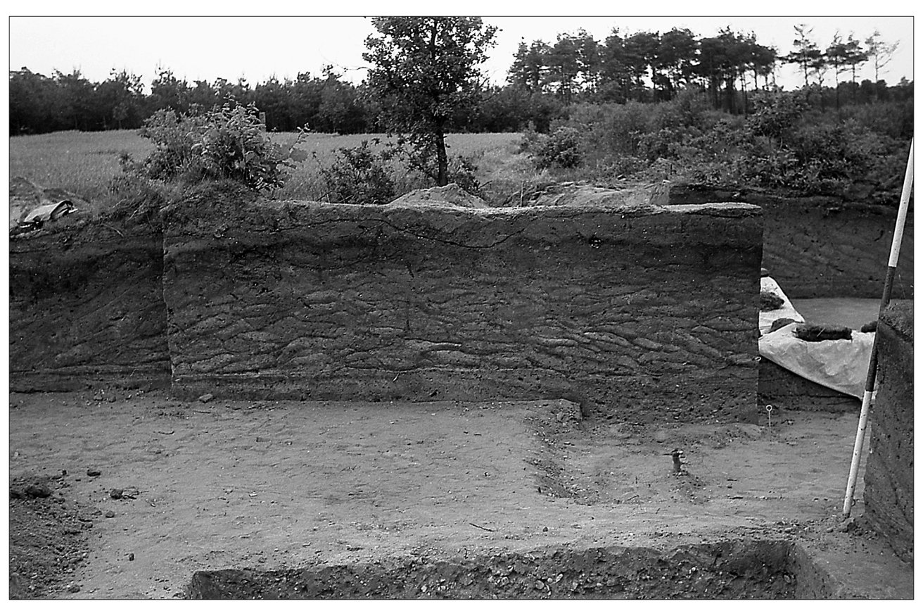
Fig. 2. Burial mound from the Middle Bronze Age on mineralogically poor cover sand in Alphen (North Brabant, South Netherlands). Both the original soil profile and the sods in the mound itself show clear characteristics of podzolization (humic podzol).