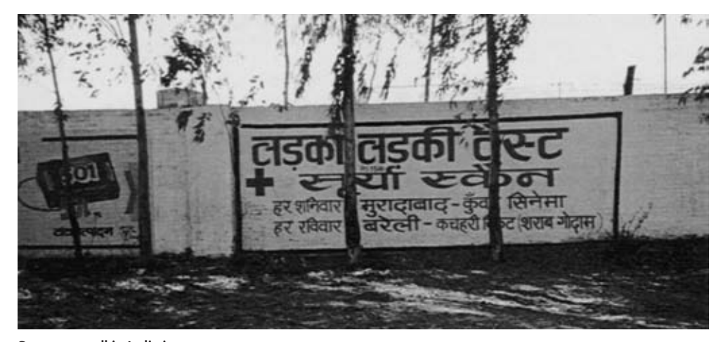
Seen on a wall in India in 1994: 'Boy/Girl Test/ Rs 1500/Surya Scan Every Saturday: Moradabad, Kunwar Cinema Every Sunday: Courts (near liquor godown)'